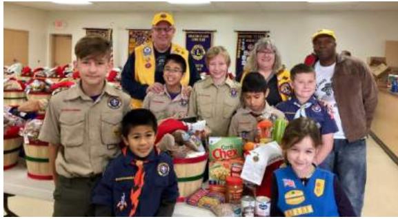
Lions and Scouts, a great combination.