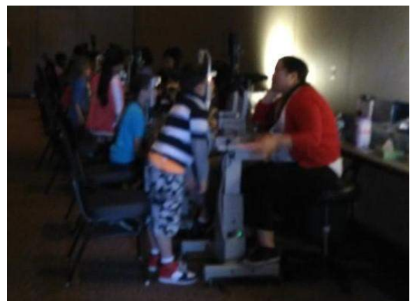
Children had dark room slit lamp exams.

to do the examinations. After all of that, kids got to chose and try on frames, and pick the one they liked best, to be fitted with their personalized prescription. Glasses will be manufactured and taken to each child' school around Valentine Day. Opticians will then make sure the glasses fit the children properly. Over 400 children a day for 4 days were screened. Lions Merrell, Bob, Chuck and Sandy helped with the distance screening and helped in the eyeglass fitting room. There were many volunteers from many different places helping, from directing children to the next station, to helping with the screenings, etc. All of this is at no cost to the parents. It is a way to make sure that all children are able to see well. There was an article in the Houston Chronicle about this program, and how children who received eyeglasses last year have improved their grades and behavior do to now seeing clearly. This is such a wonderful program. If interested in volunteering at another See to Succeed program within the greater Houston area, contact Lions Chuck or Sandy for contact information. You do NOT need to be a state certified vision screener to volunteer.