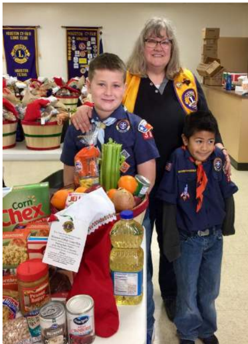
Scouts of different levels showing the content of one of the baskets.