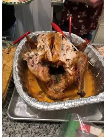
The turkey was wonderful!